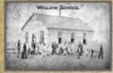
CHILDREN FROM ELLIS AND THE SURROUNDING COUNTRYSIDE VISITED WILLOW SCHOOL, A NEW SCHOOL BUILDING, ONE YEAR FROM THE END OF ELLIS IN 1878 THERE WERE ABOUT 100 CHILDREN IN THE WILLOW SCHOOL DISTRICT.