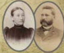
IN THE EARLY YEARS, ELLIS WAS A TOWN IN ELLIS AND IN THE LATE YEARS WAS THE PORTION OF THE BLUE HILLS.