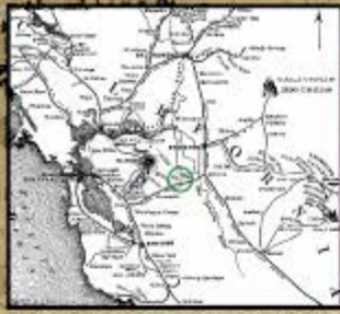
THE ROAD MAPS WERE MADE THE BASIS OF THE TRANSCONTINENTAL RAILROAD FROM SACRAMENTO TO SAN FRANCISCO. THE INFORMATION OF THE RAILROAD THE 3,000 MILES FROM NEW YORK TO SAN FRANCISCO TOOK TWO DAYS APPROXIMATELY 300 MILES A DAY. BY COMPARISON A WAGON FULL OF WOODS, WHICH WOULD TAKE ONLY THREE TO 20 MILES A DAY.